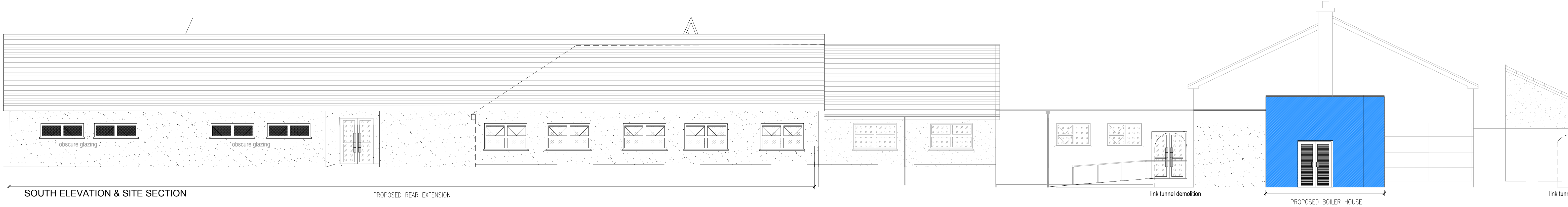
SOUTH ELEVATION & SITE SECTION