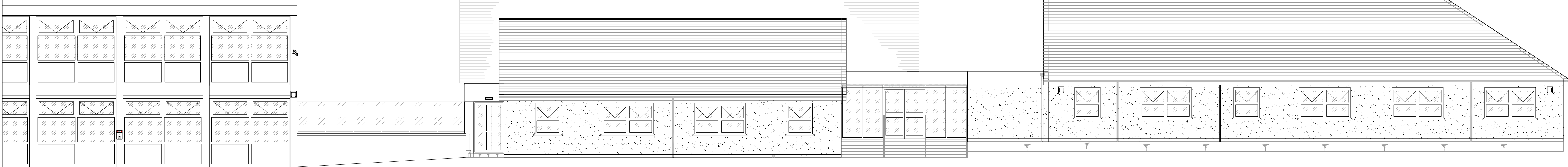
E OF FURTHER EDUCATION